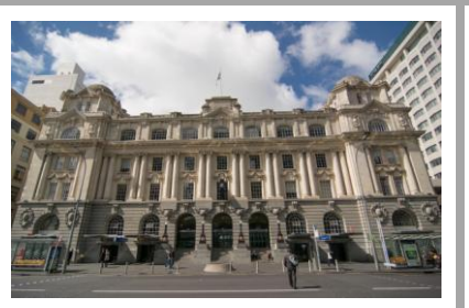
Central Train Station